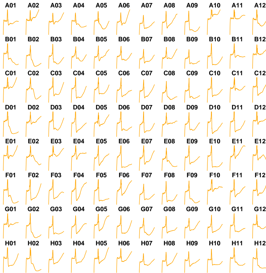
Figure 3: Plate view of a 96-well E-plate from a RTCA assay run.